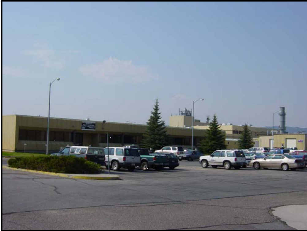
Front of Administration Office Building