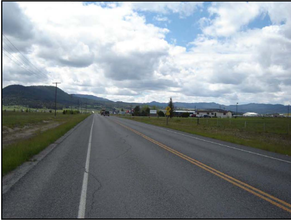
Neighborhood View Looking South