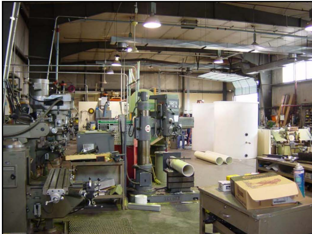
Machine Shop Interior

The building has several welding receptacles to support a wide variety of manufacturing and fabrication processes.