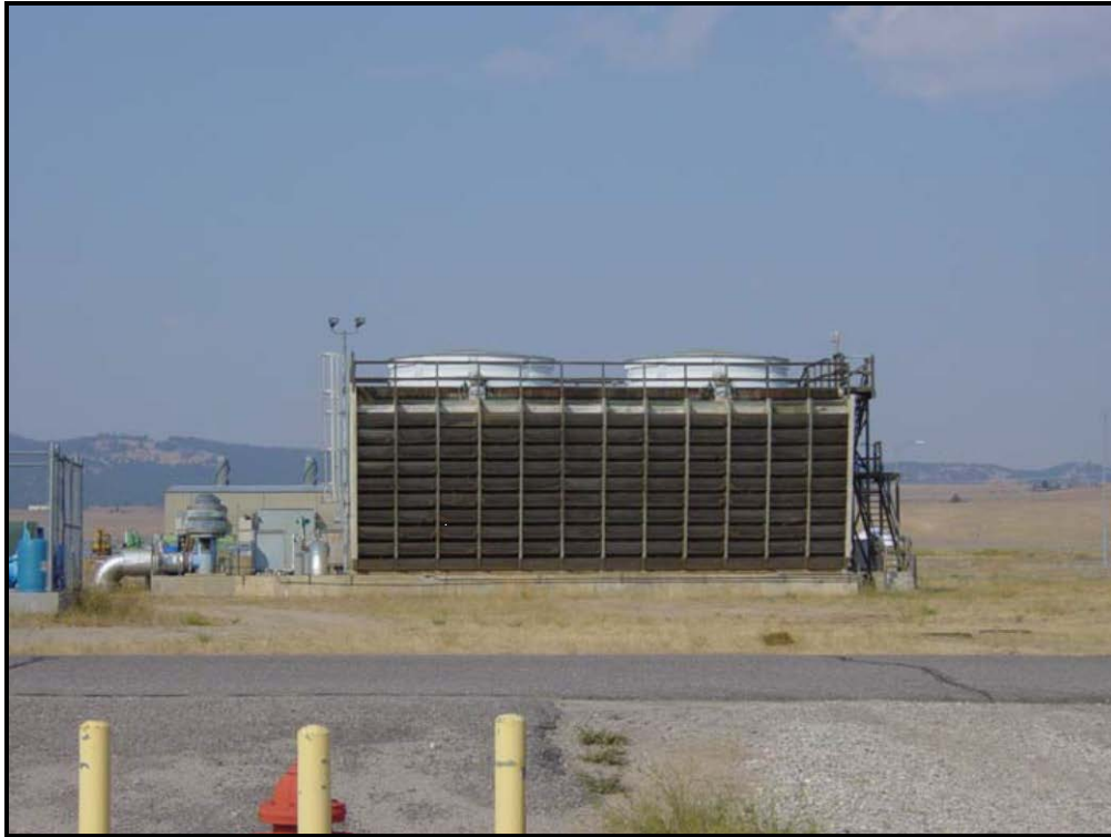
Secondary Cooling Tower Used with Testing