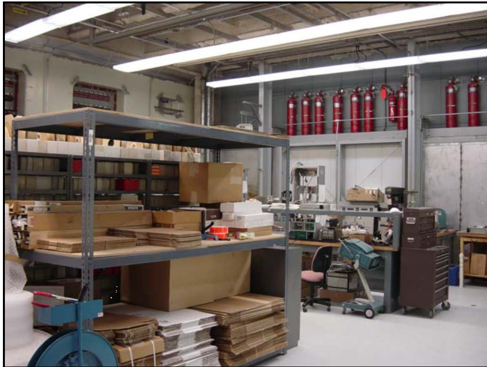
Tetragenics Circuit Board Assembly Shop