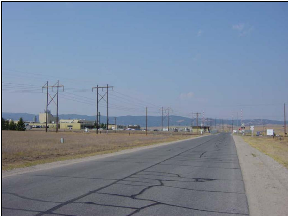
Access Road to Mansfield Center