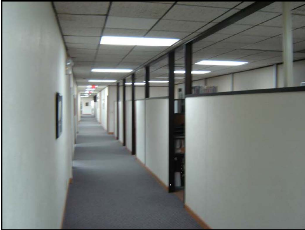
Interior View of Operations Office Building