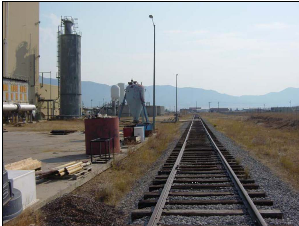
Railroad Spur which Services Site Adjacent to Building 20