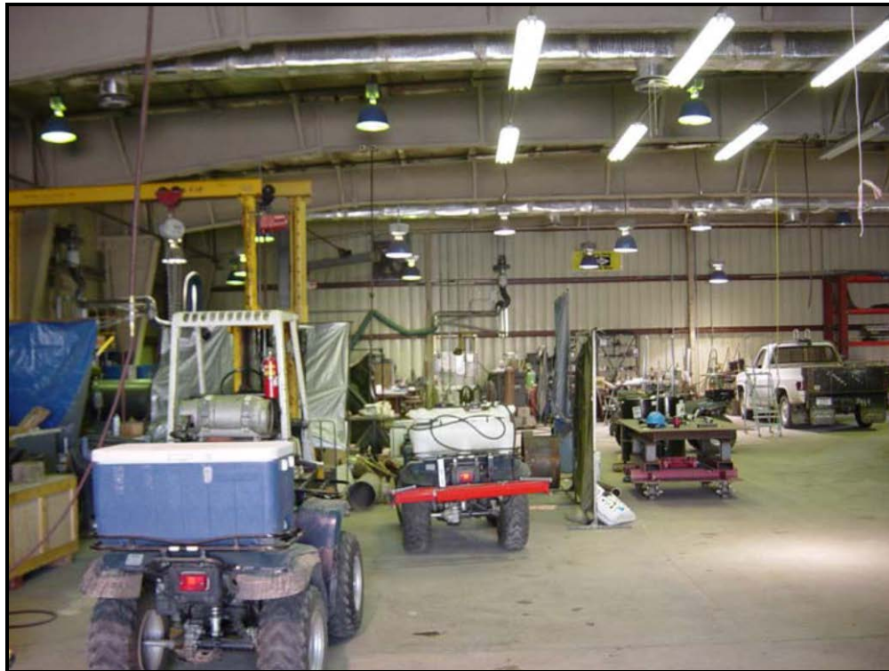
Fabrication Shop Interior