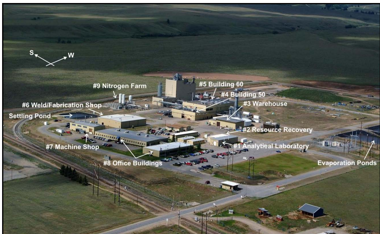
The Mansfield Center Is Secure, Adaptable, and Diverse

An aerial photograph of the Mansfield Center is shown below with the major facilities or structures labeled. Capability descriptions of these facilities or structures are listed following the figure.