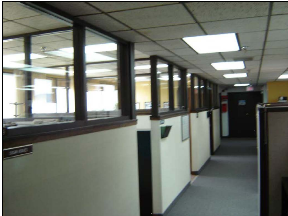
Interior View of Administration Office Building