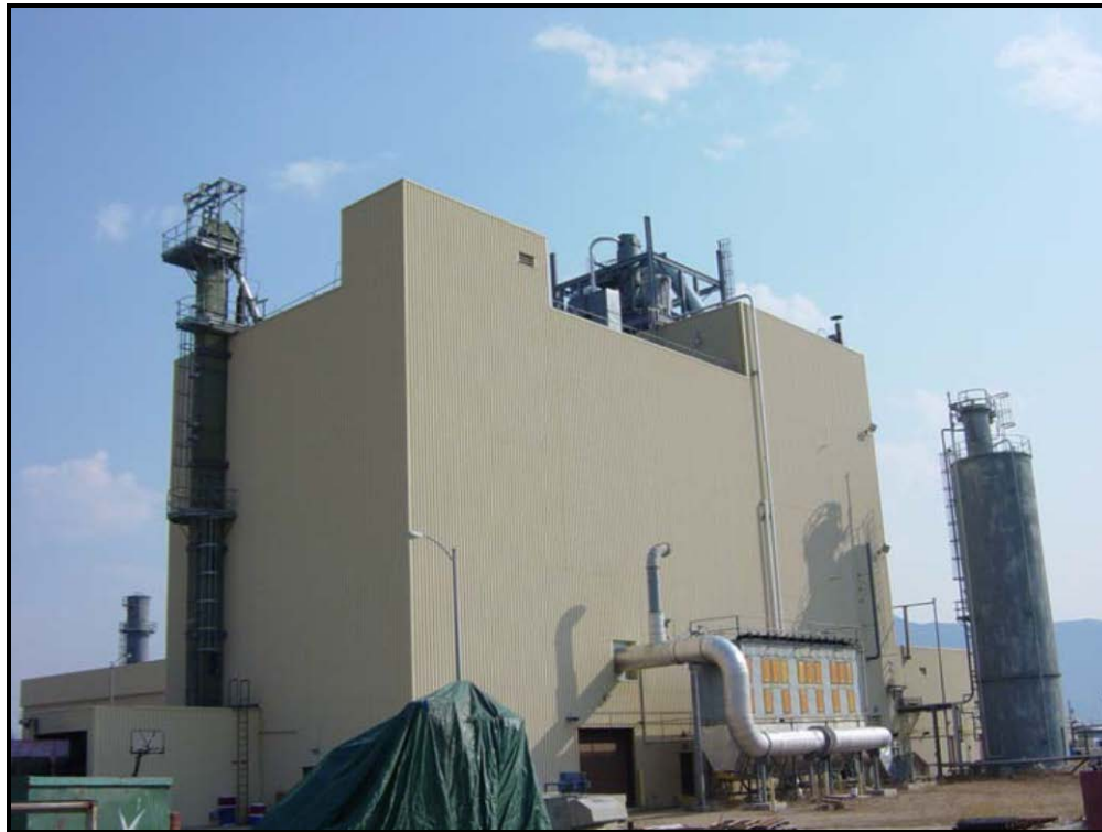
Building 20 – Dry Materials Handling