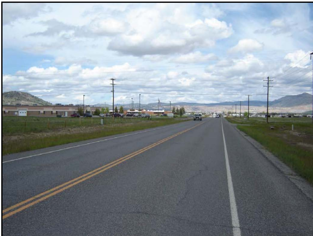
Neighborhood View Looking North