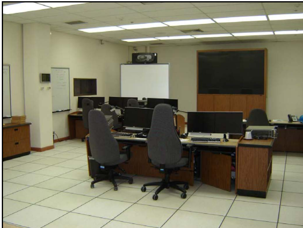
Control Room on Second Floor