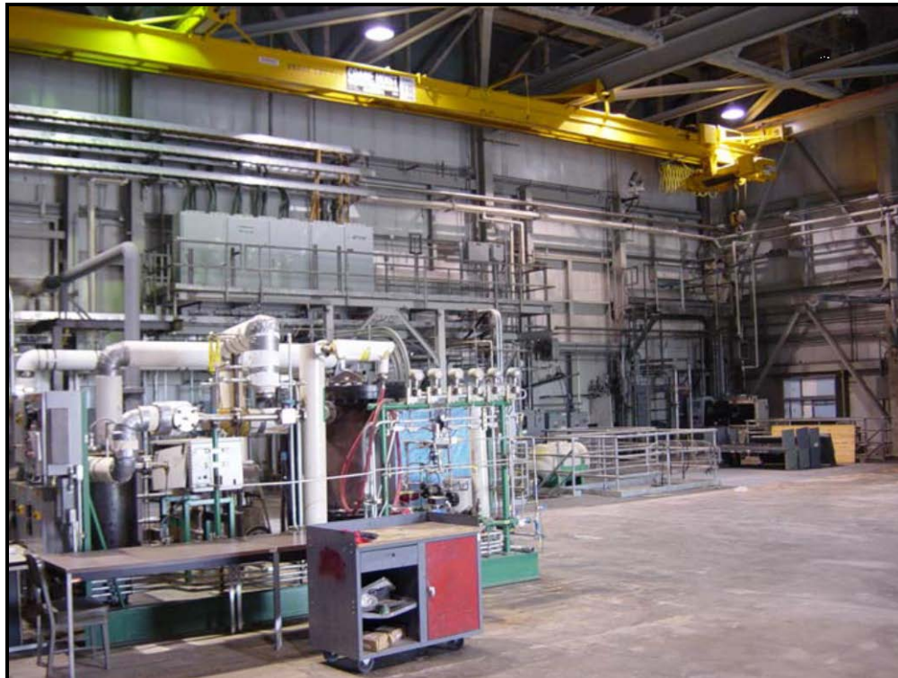
Interior View of Testing Area