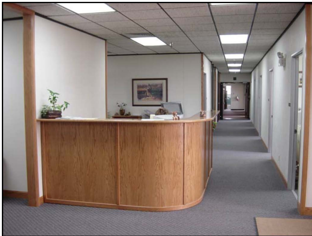
Reception Area of Operations Office Building