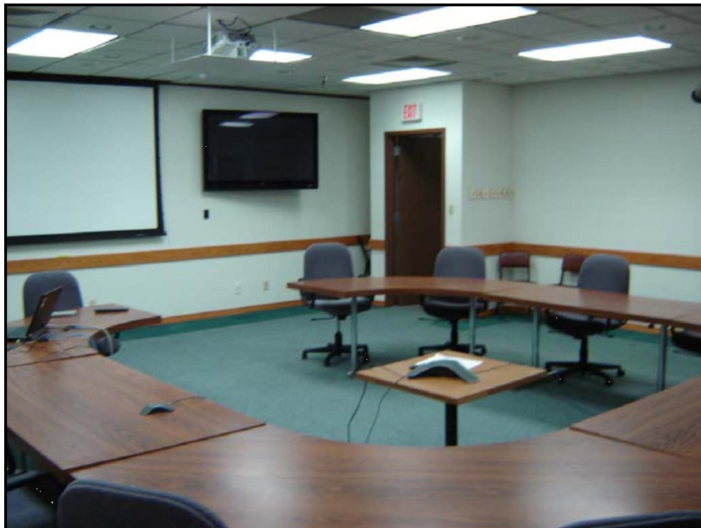
Large Conference Room of Operations Office Building